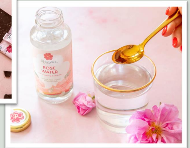
Flavouring & drinks immune system